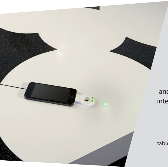
Table top from the “Corian® 2.0” exhibition (Milan, April 2014) incorporating wireless recharging for smart devices; table design by Christian Ghion; photo Leo Torri for DuPont™ Corian®; all rights reserved on design and image.

Corian® looks forward to an exciting future, not only through its valuable longevity but also in ever evolving technology. Always a few steps ahead, Corian® is now available with integral wireless recharging power for smart devices. This is a material with the needs of today and tomorrow very much in mind, from the embedding of interactive systems to its ability to be reused – and the zero impact it makes on landfill during its manufacture.